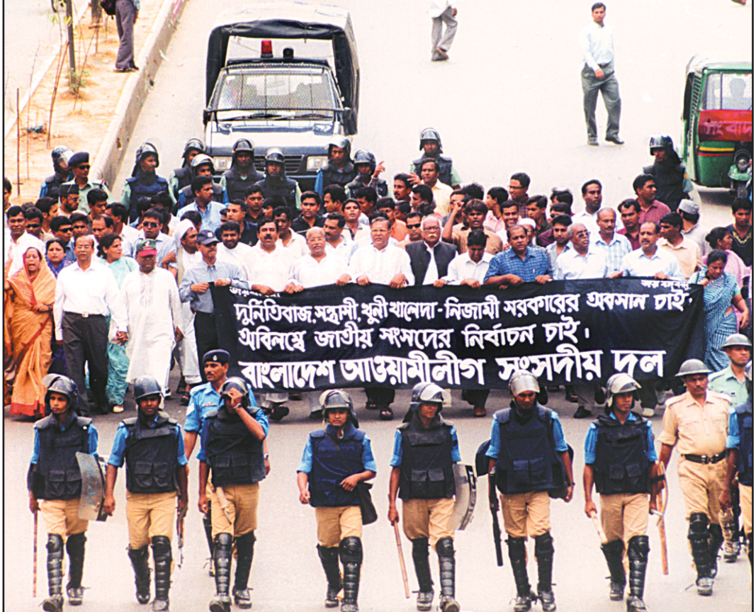
Police guard the procession of the opposition Awami League lawmakers during hartal hours at Mirpur Road yesterday. The lawmakers demanded immediate resignation of the government and midterm polls.