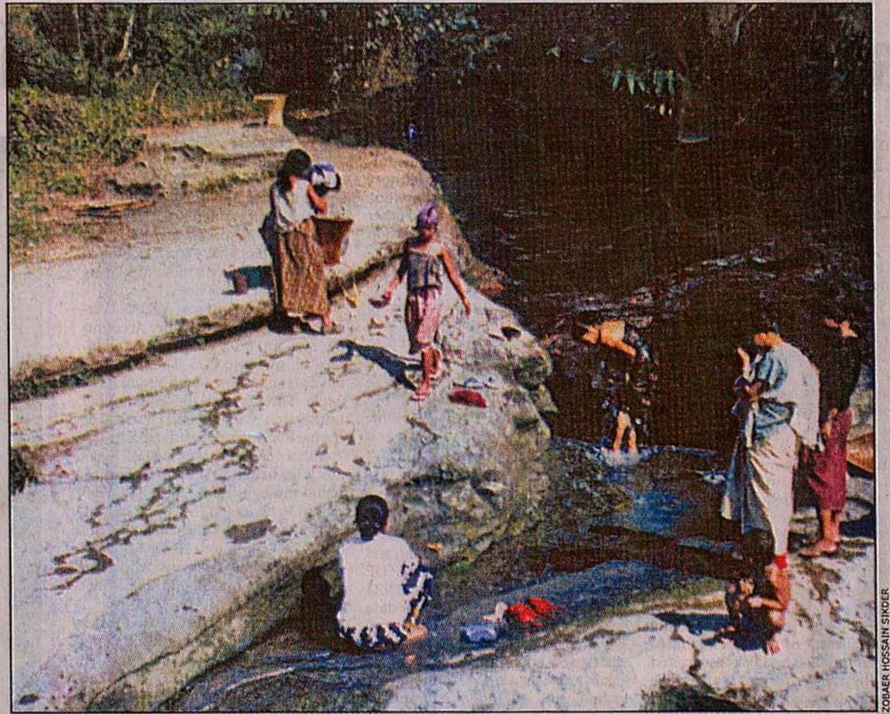
Shailadhara, a spring of tourist attraction in the hill district of Bandarban, has been drying up, causing disappointment to the visitors and a water crisis for the local people.