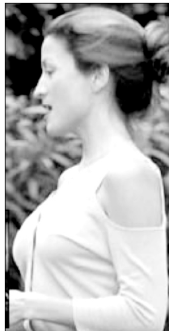
LOVE TRIANGLE? (L-R) Victoria Beckham, David Beckham and Rebecca Loos.