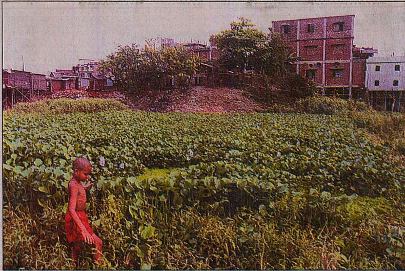
A boy wades through tangles of water hyacinth and other weeds that infest a Moghbazar pond making it a breeding ground for mosquitoes in Dhaka where residents fear a dengue outbreak.

A case was lodged with Bogra Sadar Police Station.