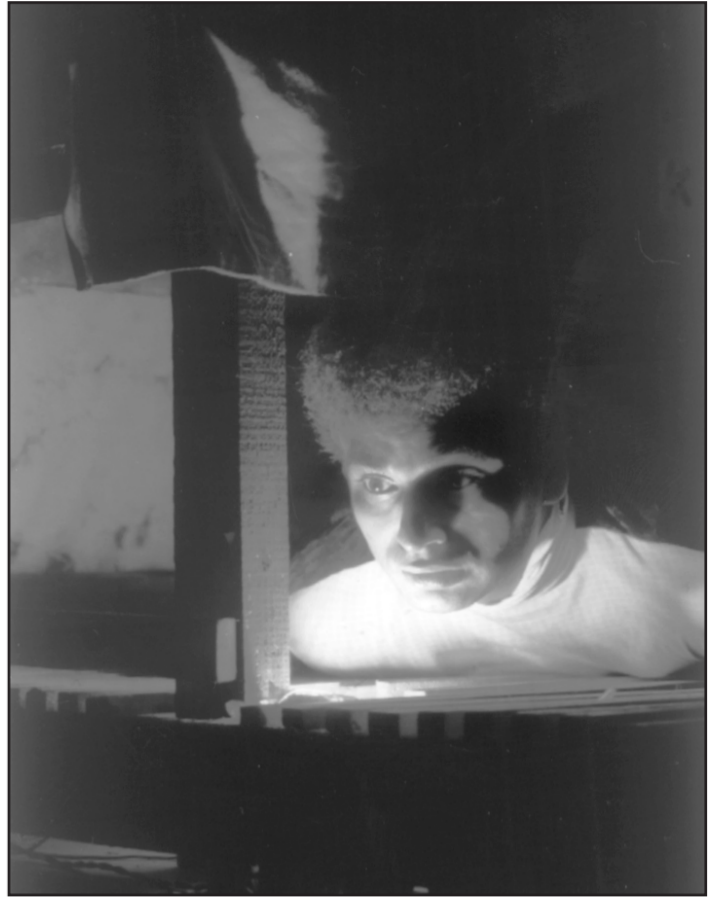
A sequence from the play Amritter Shandhane

The play Amritter Shandhane unfolds with the central character Mohin, a young struggling artist. Mohin lives with his family and tries hard to support them financially. One morning he discovers that during the night he has been transformed into a monstrous vermin or insect. Mohin's case is much like that of any person suffering from severe, particularly disfiguring, chronic illness or disability. His life story and personal identity change dramatically when he becomes a vermin. In the new identity his senses are different. His abilities change. His voice is transformed. Some of his changes are generated from within; some are conditioned by the world's reaction to his metamorphosis. Other metamorphoses also occur in the story. His family sees his state as an affront to them (after all, they expect him to support