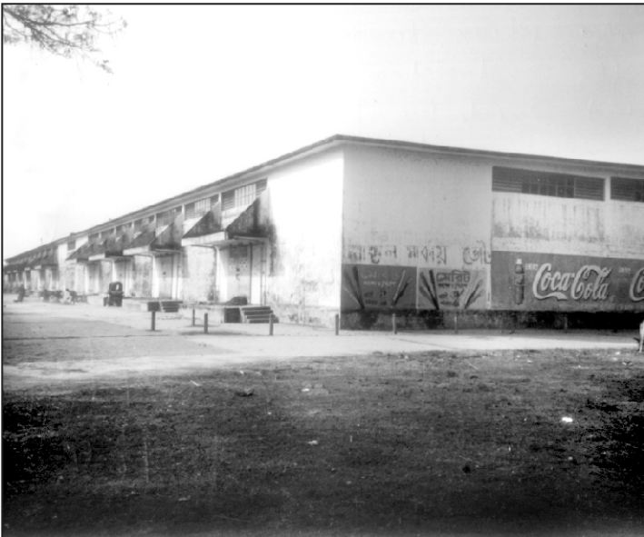
Helpless farmers ponder what to do with the harvested potato (left) and the huge unutilised BADC godown at Bhola (right).