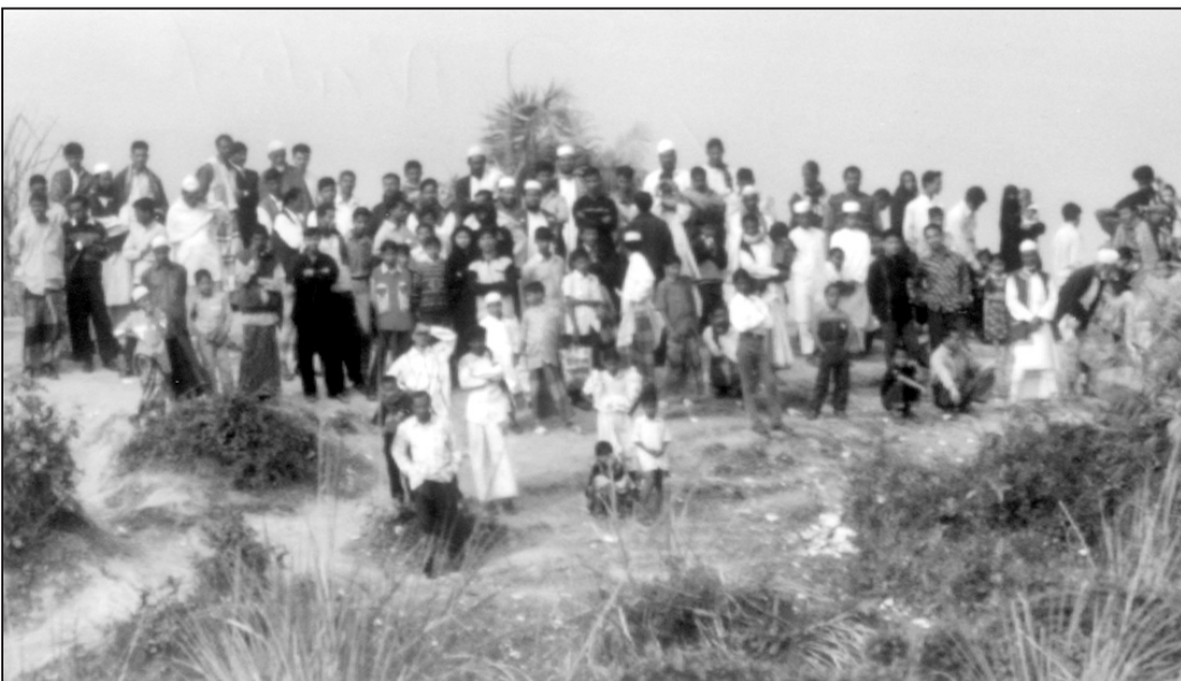
Be it scorching sun or rain, people have to wait for hours outside the Sylhet Osmany International Airport to receive or see off relatives. There is no visitors' gallery at the airport. The photo was taken recently.

This correspondent saw a large number of people queuing for water at a deep tubewell at Amran Bazar in Char Longoria. Many of them said they walked long distances with pitchers and other containers to collect drinking water.