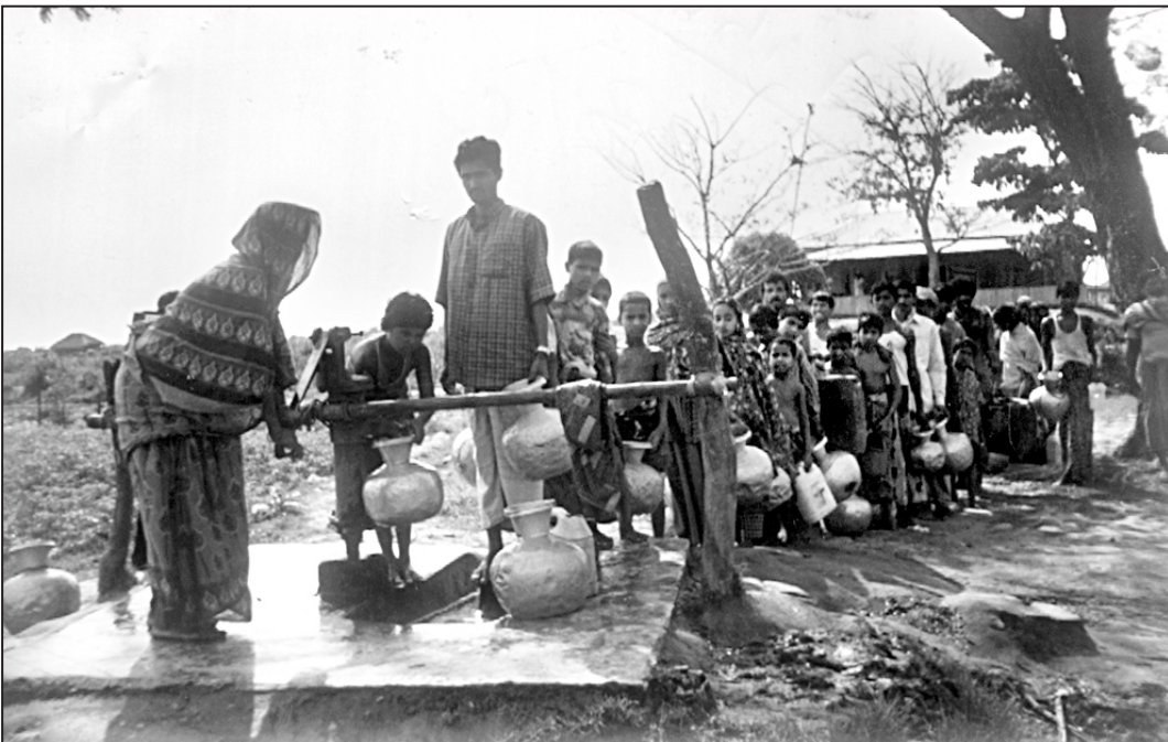
People waiting for hours for drinking water at Amran Bazar. The photo was taken recently.

He said demanding resignation of a failed government is not undemocratic. If the ruling party is confident of people's support, it should step down and face election, he said.