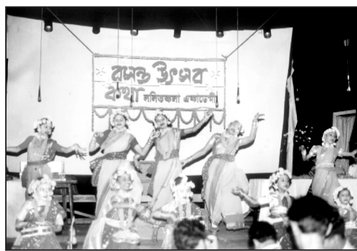
Students of the Academy perform a dance at the event