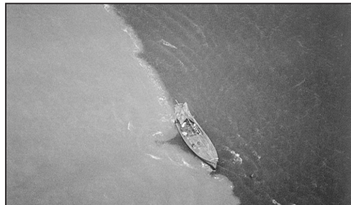
The photograph shows a trawler plying exactly along the line where the two currents mingle in the estuary of the river Maheshkhali and the Bay of Bengal

Concrete structures also acquire wonderful effects in Sharif's photos. The Smritisoudho at Savar and the Lalbag Fort are projected with their entire area, which brings up another perspective of these urban structures' beauty. Often the photographs of the same place taken at different times show changes in its surroundings. And thus Sharif's photos become