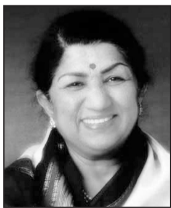
sing and my songs become immortal.