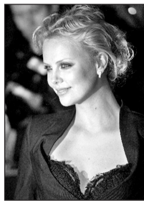
Oscar winning South African actress Charlize Theron arrives at the Warner Village Theatre in London on March 31 for the premiere of Monster...