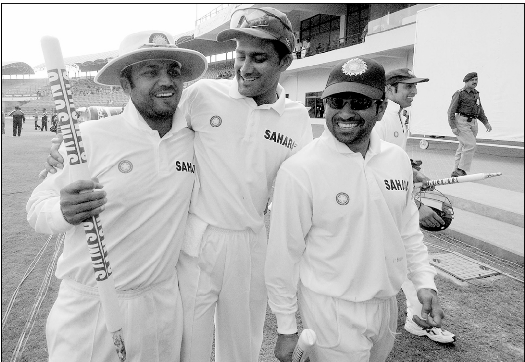
THREE CHEERS! India's three architects of the historic victory over Pakistan (L-R) Virender Sehwag, Anil Kumble and Sachin Tendulkar walk around the Multan Cricket Stadium yesterday after the match had finished.