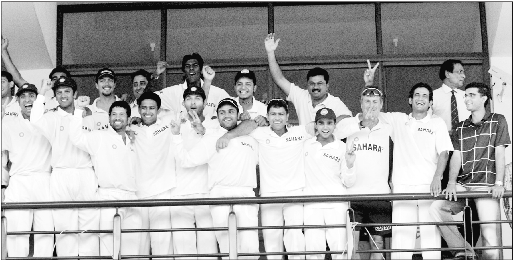
COMING OF AGE: Injured captain Saurav Ganguly (extreme R) looks admiringly at his triumphant Indian team as they celebrate victory over Pakistan in the first Test at Multan yesterday.