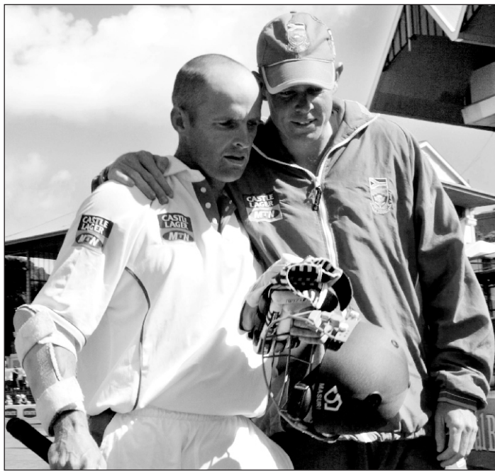
GOODBYE: South African Gary Kirsten (L) leaves the field after he was dismissed for 76 as teammate Shaun Pollock puts his hand over the retiring batsman's shoulders on the fifth and last day of the third Test against New Zealand in Wellington yesterday.