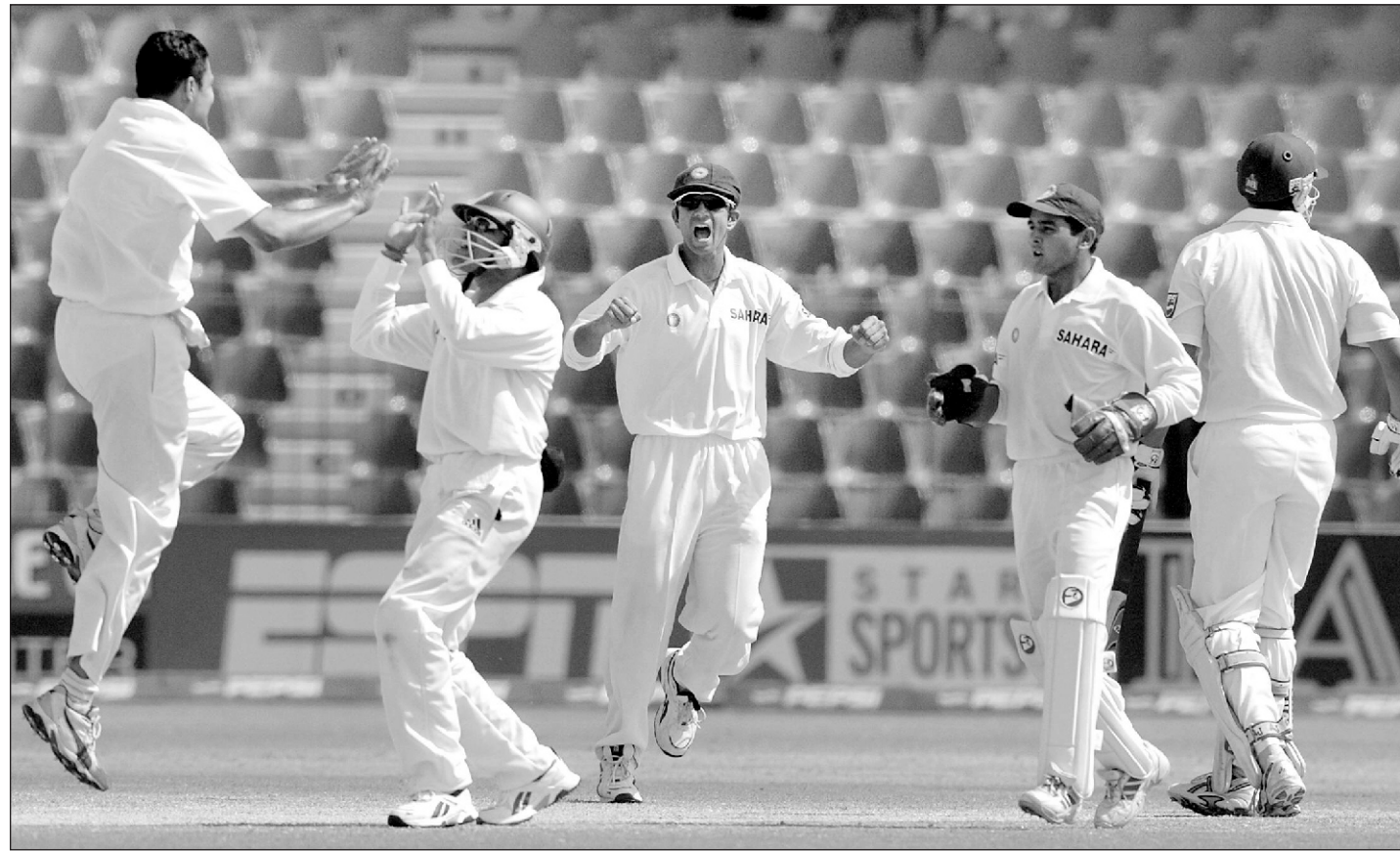
India spinner Anil Kumble (L) goes up to celebrate the dismissal of Pakistan captain Inzamamul Haq (R) on the second day of the first Test in Multan yesterday.