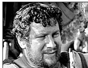
Ustinov as a slave trader in Spartacus

Sir Peter was born in London in 1921, after his father, an officer in