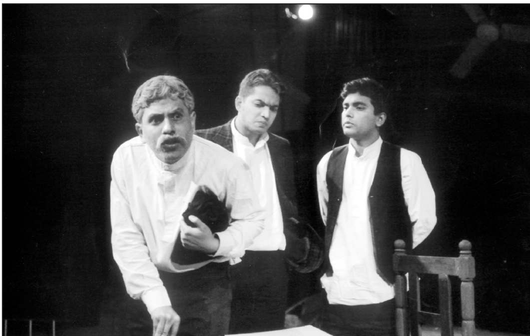
A scene from the play Kopeniker Captain

As a director, Aly Zaker is realistic and has followed the European Theatre concept. He has successfully handled three sequences simultaneously. He has created 49