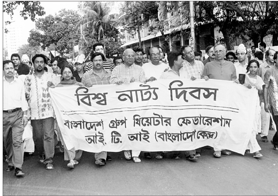
A colourful rally led by Bangladesh Group Theatre Federation and International Theatre Institute (Bangladesh Centre)

Through their discussion, we learnt that theatre in Bangladesh has created many artists, directors, playwrights, technical designers and limited middle class audience. In that sense theatre has an impact only in micro level. It has no impact at all in the macro level or the social, economical or political aspects of Bangladesh. Even the middle class, the main audience of theatre, is reluctant to come and enjoy theatre due to the lack of theatre halls. The consequence