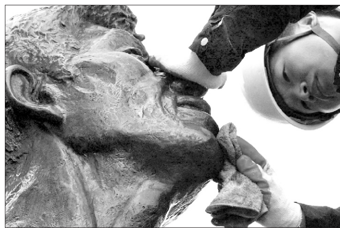
A South Korean scrubbing a bronze statue's chin during the street and park cleanup event for spring in Seoul on March 26.

For anyone with a love for the nuances of Bangla poetry, the show was definitely appealing.