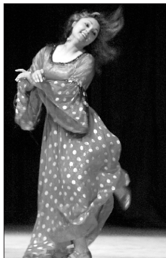
An Iraqi dancer performs at the National Theatre in Baghdad. The festival was the third cultural event to take place since the fall of Saddam Hussein's regime.