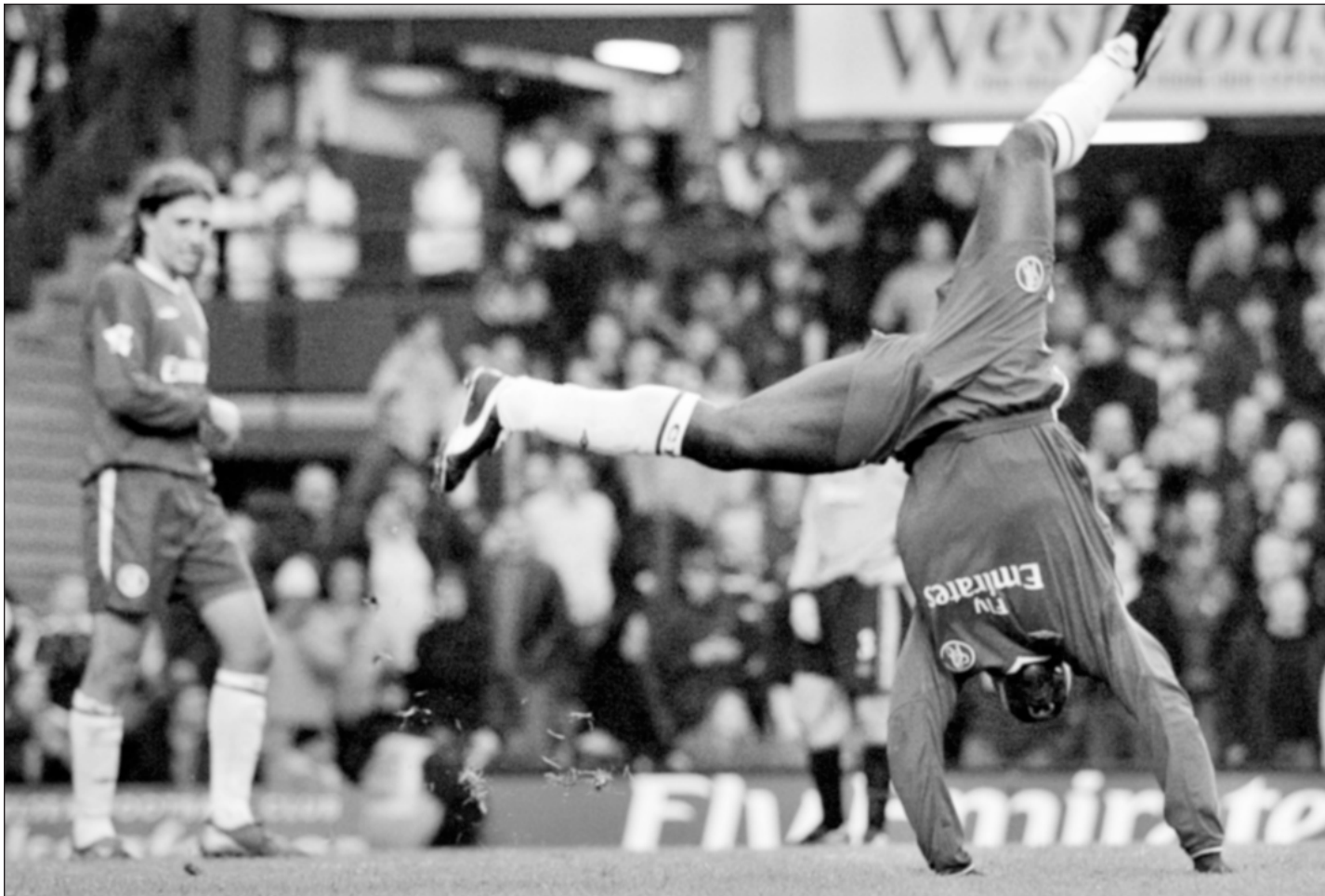
JIMMY SPECIAL: Chelsea's Dutch international striker Jimmy Hasselbaink (R) doing a cartwheel as teammate Herman Crespo (L) looks on in appreciation after his hattrick against Wolverhampton at Stamford Bridge in London on March 27.