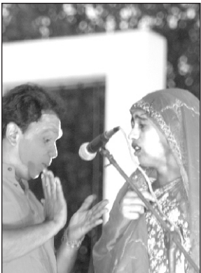
Padatik presents Takar Lane on March 26, at the Central Shaheed Minar