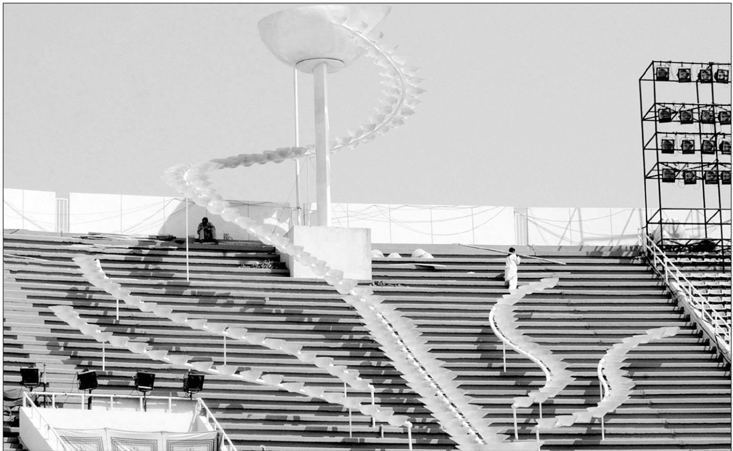
The torch for the 9th South Asian Federation (SAF) Games being readied at a sports complex in Islamabad yesterday, two days before the start of the Games.

The jinxed Games, in which Pakistan, India, Sri Lanka, Bangladesh, Bhutan, Nepal and Maldives traditionally compete, were first postponed in October 2001 after the September 11 terror attacks on the United States.