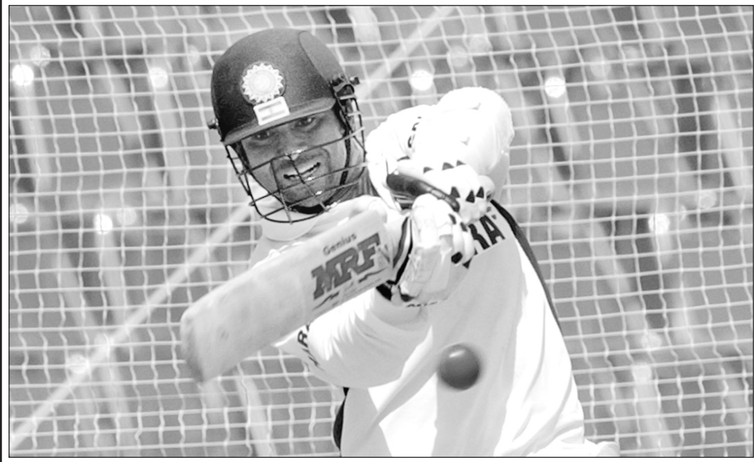
Sachin Tendulkar hones his batting skills in the nets at the Multan Cricket Stadium yesterday.