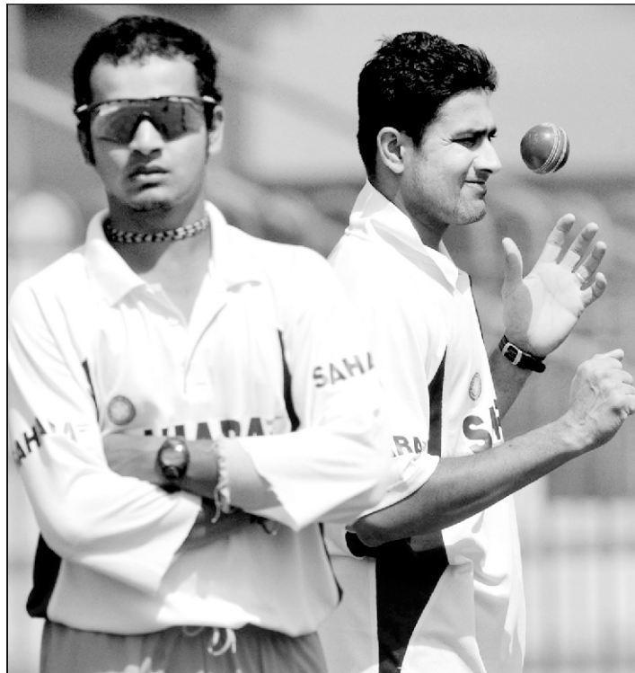
SPIN VS PACE! (L) India spinners Anil Kumble (R) and Murali Kartik get ready for a practice session while (R) Pakistan fast bowler Shoaib Akhtar bowls in the nets during their training session at the Multan Cricket Stadium yesterday.