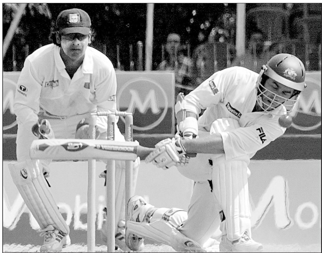
Australia's Justin Langer, who scored a massive 166 to put his side atop against Sri Lanka, here misses a sweep on the fourth day of the third and final Test at the Sinhalese Sports Club ground in Colombo yesterday.

The second Test will be played in Lahore from April 5-9 and the third in Rawalpindi from April 13-17.