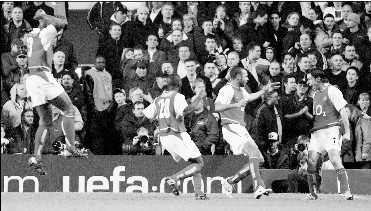
HAPPINESS! Arsenal's Robert Pires (R) celebrates with teammates (L-R) Sol Campbell, Kolo Toure and Thierry Henry after scoring against Chelsea at Stamford Bridge, London on March 24.

Responding to questions that Robson might stay on beyond then, Shepherd replied: "Knowing Bobby, I wouldn't be surprised by anything that happens. He's a one-off."