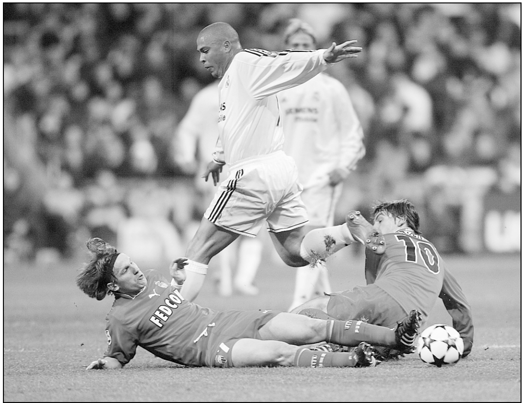
Real Madrid's superstar Ronaldo (C) being tackled by Monaco's Argentinian midfielder Lucas Bernardi (L) and Spanish forward Fernando Morientes at the Santiago Bernabeu stadium in Madrid on March 24.

Nevertheless, Monaco's two away goals have given their coach Didier Deschamps slight hope that they can cause an upset and overhaul the two-goal deficit to reach their third semi-final in a decade.