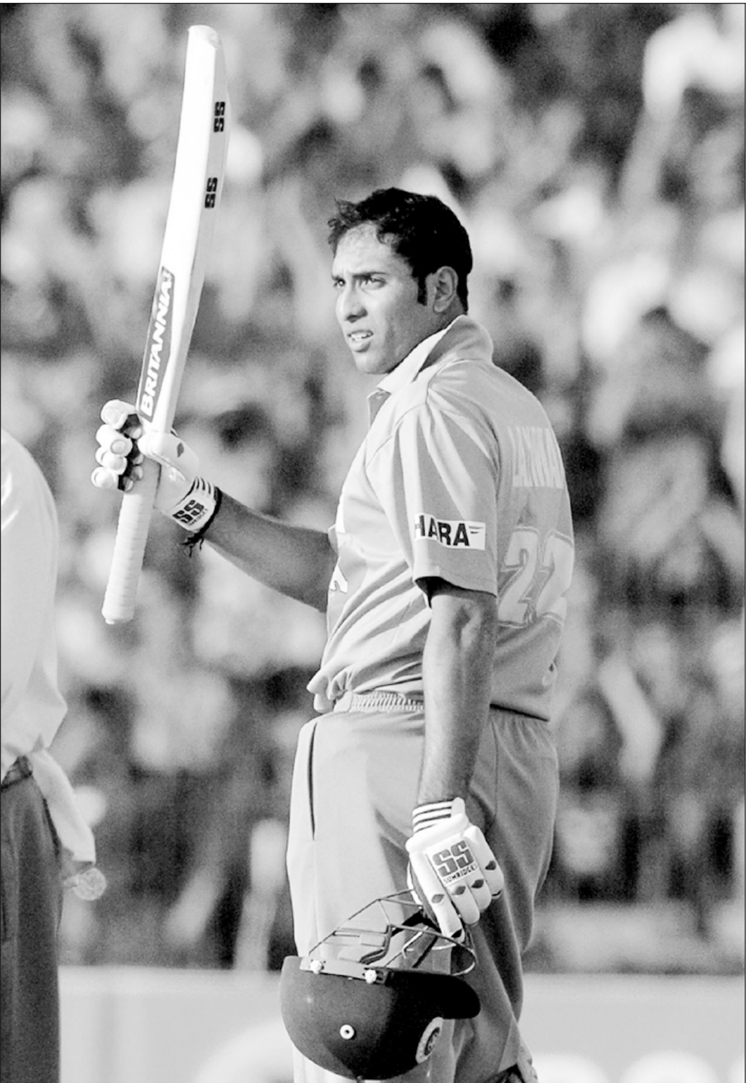
BAT OF GOLD: India's wristy genius VVS Laxman raises the bat after reaching his hundred in the fifth and final one day international against Pakistan at Lahore yesterday.

Chess enthusiasts can even follow the tournament by logging on to www.bsc-online.org.