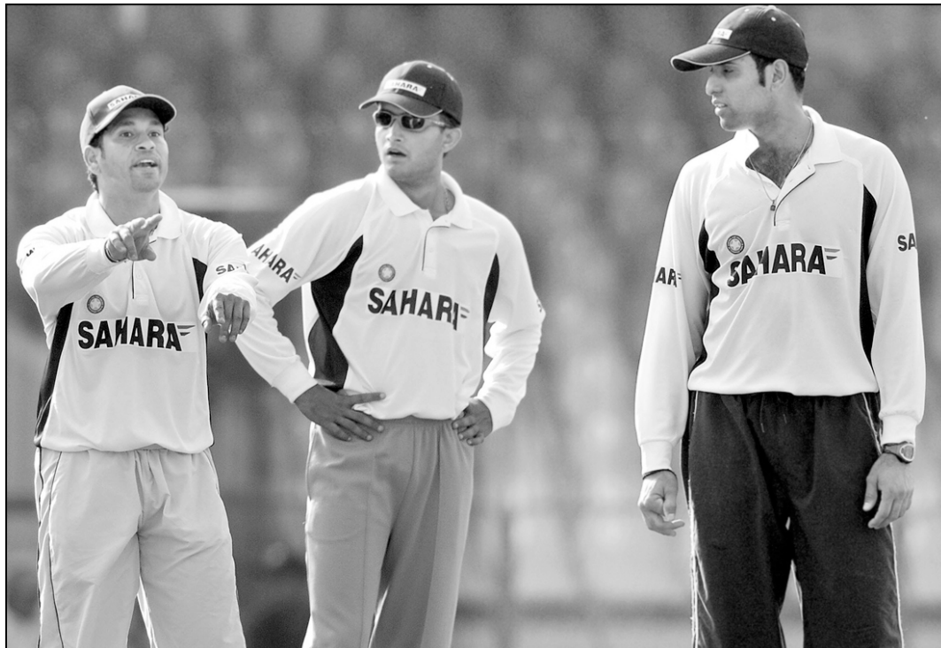
STAR PAIN! (L) India's under-performing batting aces Sachin Tendulkar (L), captain Sourav Ganguly (C) and Venkatsai Laxman discuss something while (R) Pakistan coach Javed Miandad (R) tries to draw fast bowler Shoaib Akhtar's, who has been unusually erratic in the current series, attention to something during their respective training sessions at the Gaddafi Stadium in Lahore yesterday ahead of today's high-voltage fifth and final one-day international.