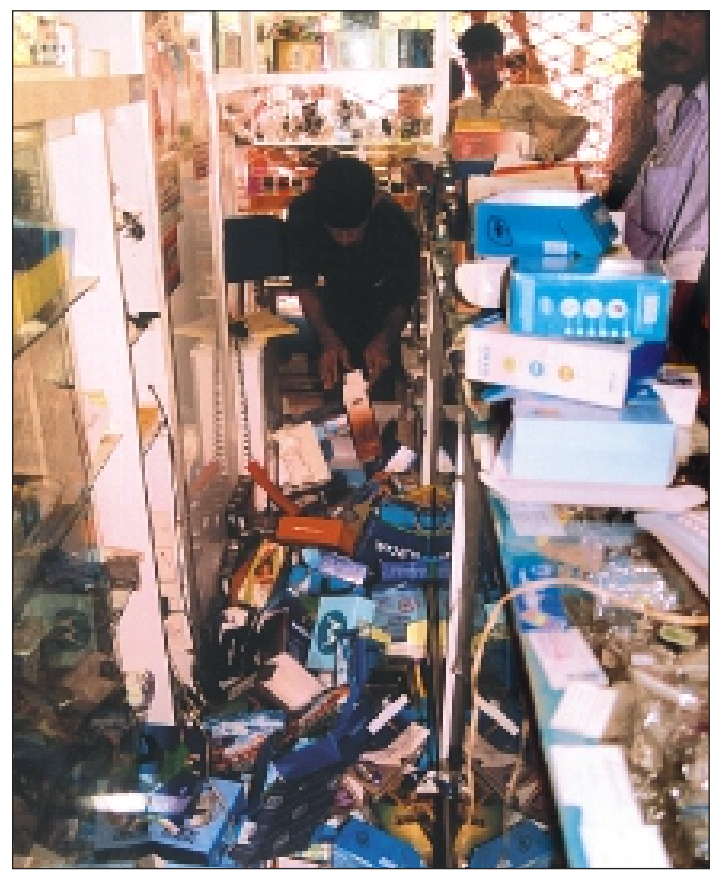
Empty phone boxes lie scattered on the floor after robbers looted a mobile phone store at the city's Stadium Market yesterday.

died in the initial assault. The A case was lodged with military sent in thousands of rein-Motijheel Police Station. Police forcements over the following two failed to nab anyone till 7:00 last SEE PAGE 11 COL 3 evening