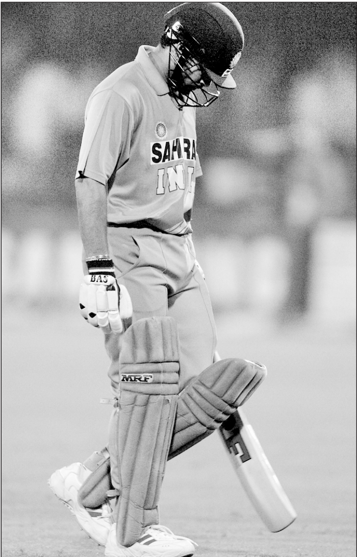
India superstar Sachin Tendulkar trudges back to the dressing room after he was dismissed for 7 in the day-night fourth one-day international against Pakistan in Lahore yesterday.

Umpires: Simon Taufel (Australia) and Asad Rauf (Pakistan).