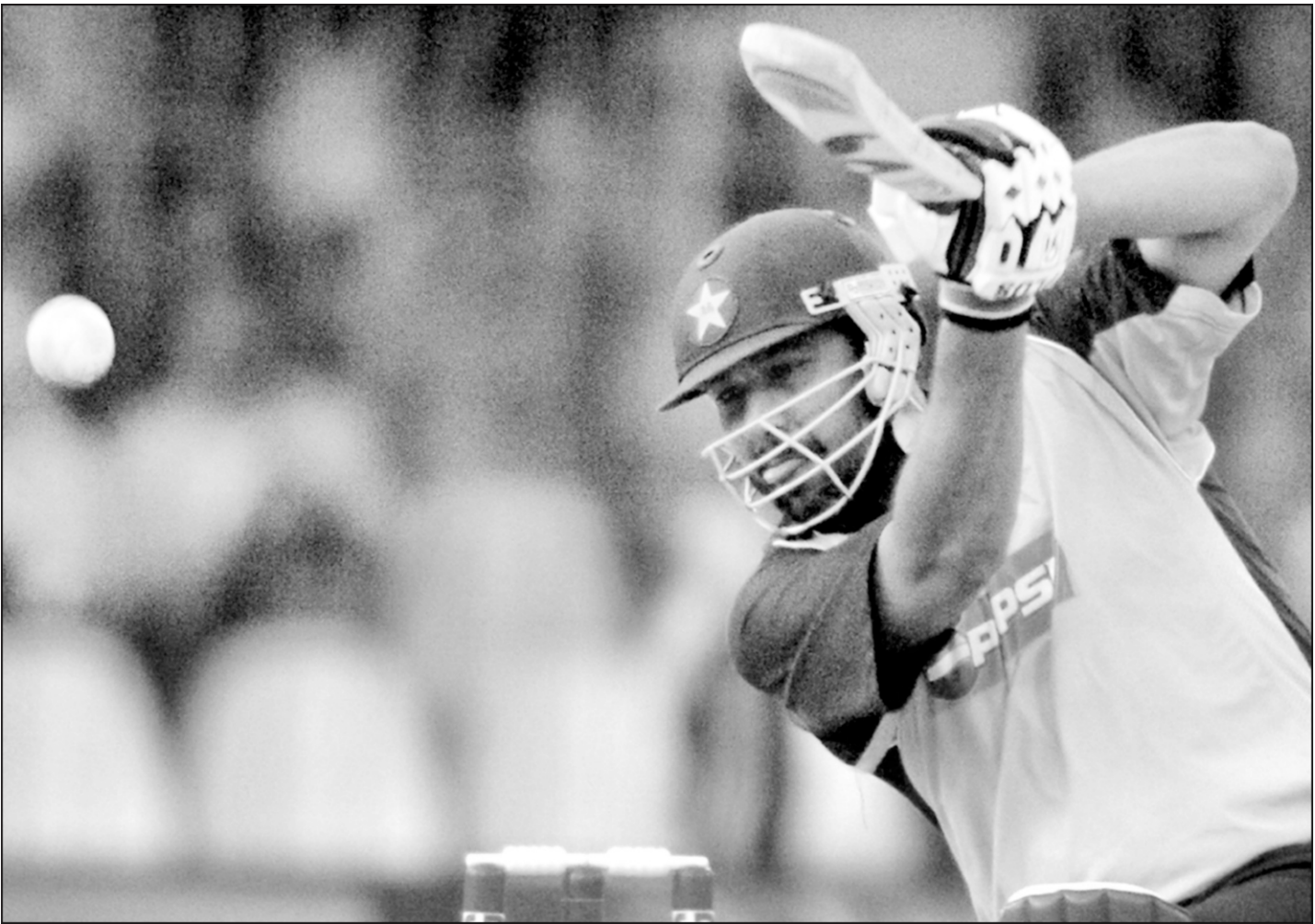
LEADING FROM THE FRONT: Pakistan captain Inzamamul Haq follows through on an off drive on way to making 123 against India in the fourth one-day international at Lahore yesterday.

Trescothick continued his wretched form on his first tour of the Caribbean when he miscued a hook at a short delivery from Tino Best and was caught at square leg by Adam Sanford.