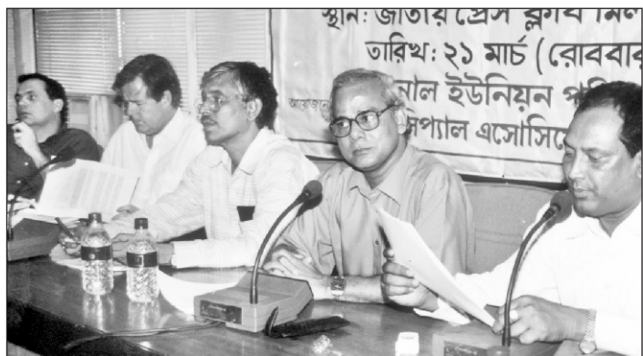
National Union Parishad Forum (NUPF) and Municipal Association of Bangladesh (MAB) held a roundtable on '14th constitutional amendment bill and status of the local government' at the National Press Club in the city yesterday.