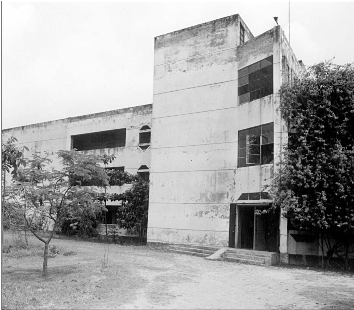
SYED ZAKIR HOSSAIN