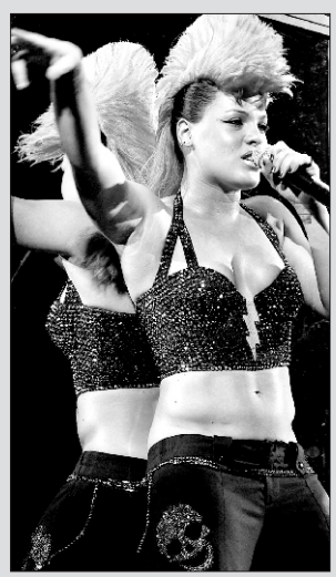
US singer Pink performs on stage on March 17 at the Bercy Hall in Paris during her European tour.