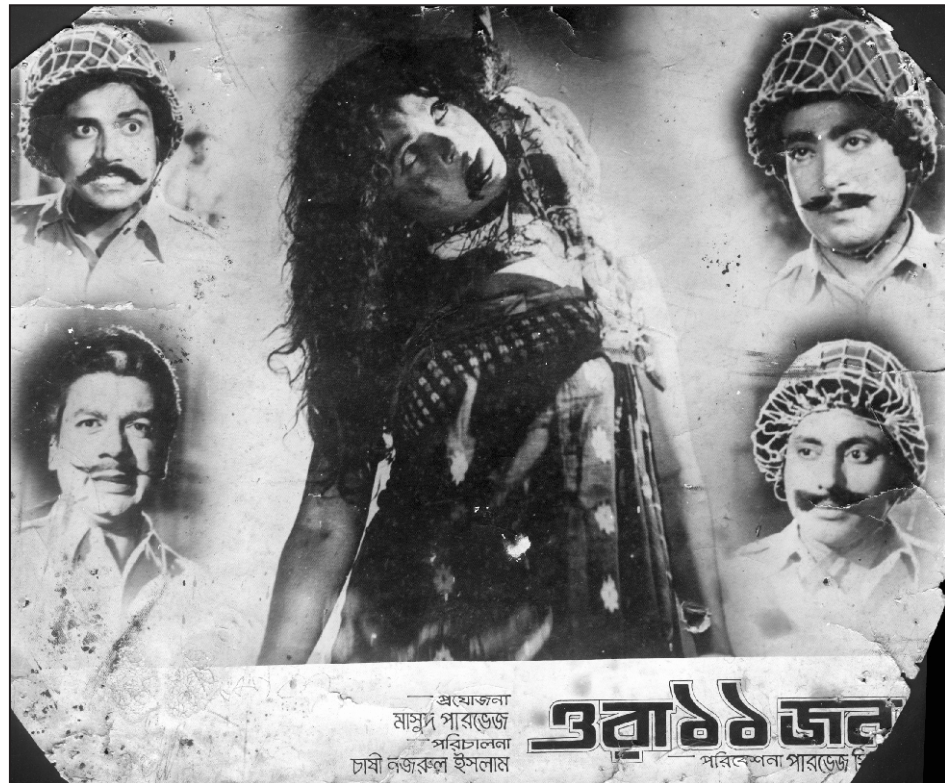
The official poster of the film Ora Egarojon

SEVERAL films have been made on the Liberation War. Ora Egarojon, produced by Masud Parvez, popularly known as Sohel Rana, stands apart from the rest.