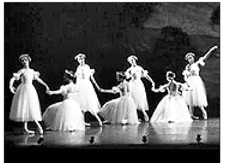
The ballet recently had to cancel Les Liaisons Dangereuses.

'We are always thrilled when people in the public eye with a connection to dance, like our chairman Angela Rippon and Betty Boothroyd, step forward and voice their support for us,' he added.