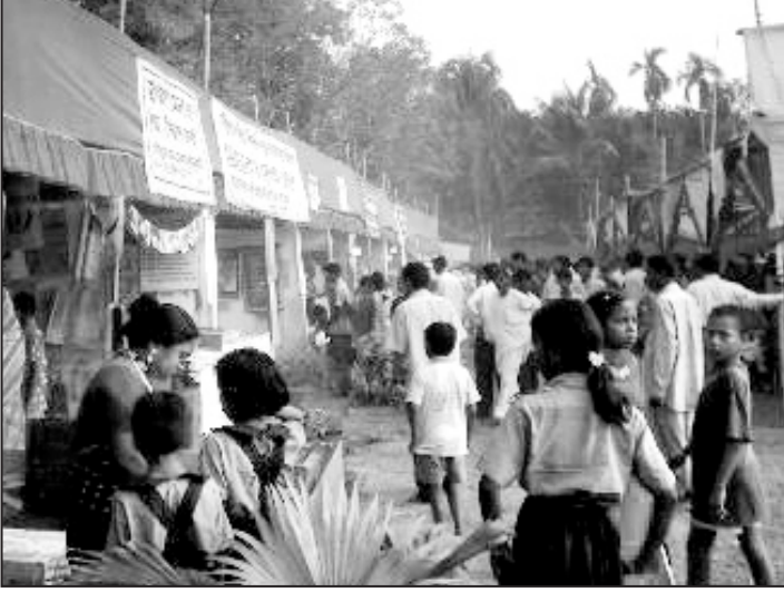
A partial view of the big rally (left) at Domar and the fair displaying products made by underprivileged women (right).