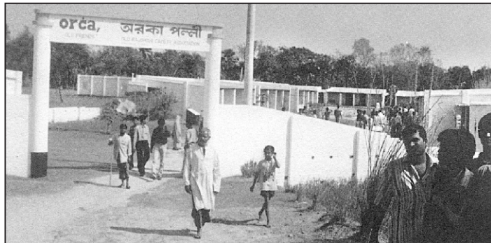
ORCA Palli for 30 homeless families

Since its foundation in 1972, ORCA has always been aware of its responsibilities to the nation. Besides strengthening the umbilical bond among its members it has also stood by the needy and the afflicted. After almost all the severe natural calamities in the country, ORCA members have participated in relief activities. On the occasion of Amar Ekushey (February 21) this year, ORCA made history in voluntary blood donation in the country. The organisation collected 301 bags of blood--the largest collection ever made in a single