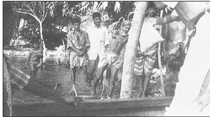
ORCA delivering relief goods among flood-stricken people

Entertainment is not always just for the sake of entertainment. It often extends beyond that as an endeavour for good causes. The concert arranged by the ORCA Ladies Club is such an event.