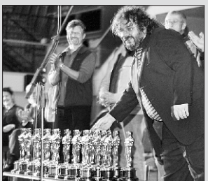
The 22 Oscars won by the Lord of the Rings sit on a table in front of the 300 assembled fans that turned out to see director Peter Jackson and the Return of the King winners during Wellington city's Oscar celebration at the Queens Wharf Event Centre, Wellington 18 March. Seventeen of the Oscar winners were present with their 22 Oscars.

March 25 A musical programme will be held at the cafeteria at 9:30 pm. The members of the institute can enjoy the show free of cost.