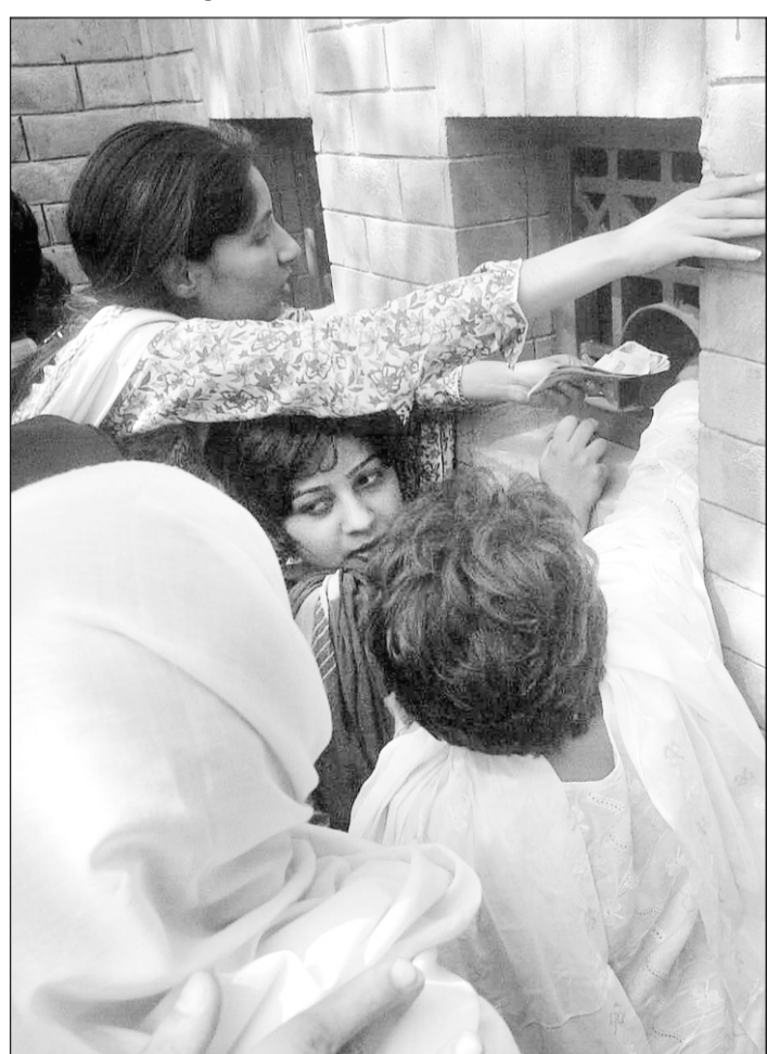
I HAVE TO GET THE TICKET: A Pakistani female cricket fan just can't wait in a long queue to get her ticket as many stand in front of the counter in Lahore yesterday. Pakistan and India meet in Lahore in the fourth and fifth ODIs on March 21 and 24.