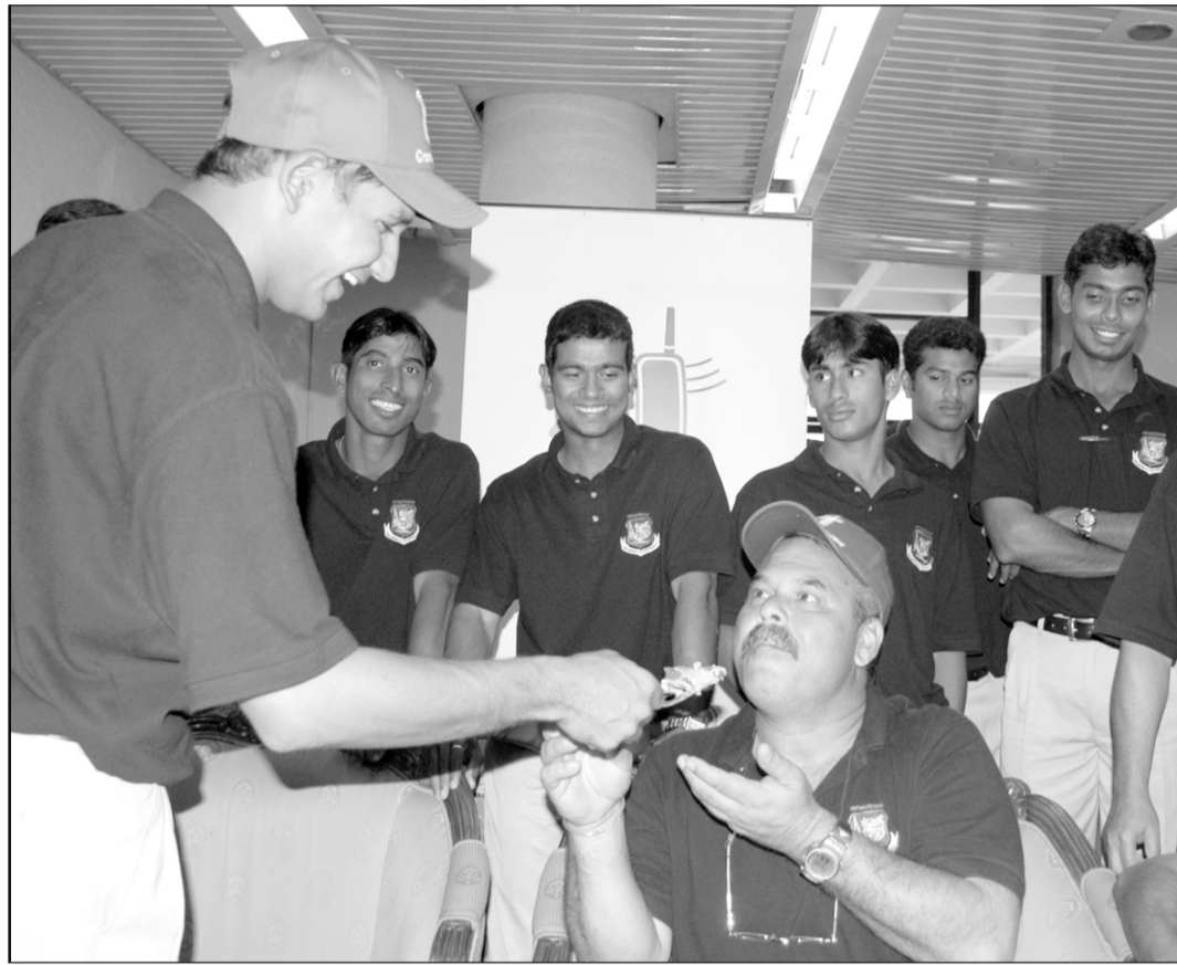
THANKS FOR THE HALF-CENTURY! Bangladesh cricket captain Habibul Bashar offers coach Dav Whatmore a piece of cake after their arrival at the Zia International Airport yesterday morning. The coach turned 50 on March 16.