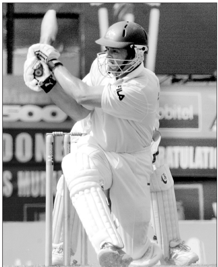
Australia's Adam Gilchrist follows the path of a powerful sweep on way to an unbeaten 140 on the second day of the second Test against Sri Lanka in Kandy yesterday.

Ponting suffered the injury while fielding in the morning and day after conceding a lead of 91 runs. Damien Martyn said it was unbeaten not certain