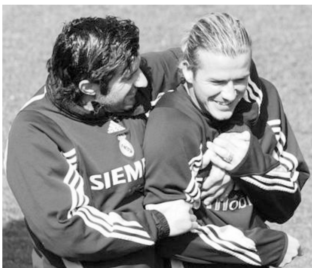
Real Madrid's Portuguese superstar Luis Figo (L) jokes with teammate David Beckham during a training session in Madrid on March 17.

umpires: Simon Taufel (Australia) and Asad Rauf (Pakistan).