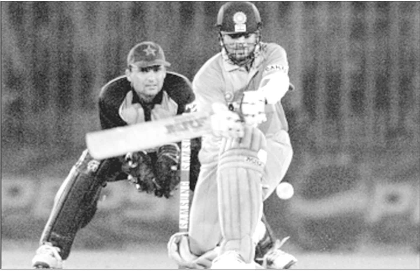
GROUND BREAKER! India's master batsman Sachin Tendulkar sweeps Pakistan spinner Shoaib Malik during his majestic hundred at Rawalpindi yesterday. Tendulkar became the first Indian to hit a one-day international century on Pakistani soil. He also passed 13,000 career runs in ODIs during the course of his 141 off 135 balls.

The Indian cricket team last toured Pakistan in 1989 and the ongoing series has frenzied fans in both countries. The excitement proved too much for one India supporter who died of a heart attack during Saturday's match.