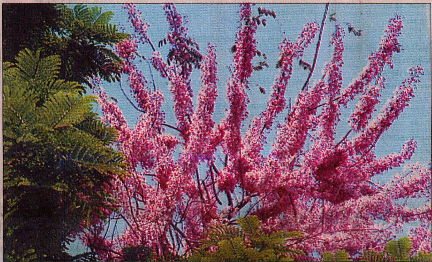
A tree is in flower in front of the Supreme Court. The blooming of blossoms signifies the presence of spring and symbolises a bright future in many Asian cultures.