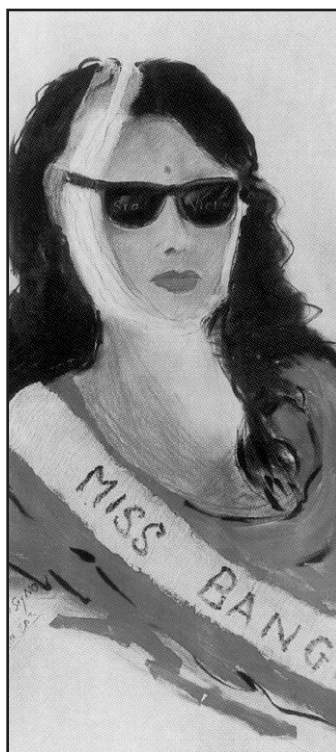
The Right to say no by Kuhu

'Responsibility', by Kanak Champa Chakma, uses paper collage on the canvas and brings in a traditional theme in an impressionistic way. The collages include a vertical yellow band to the right, and a horizontal one in the forefront, which forms the woman's