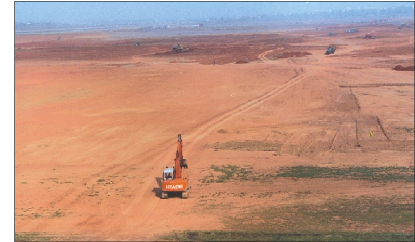
Earth diggers and bulldozers work for expansion and uplift of Zia International Airport.