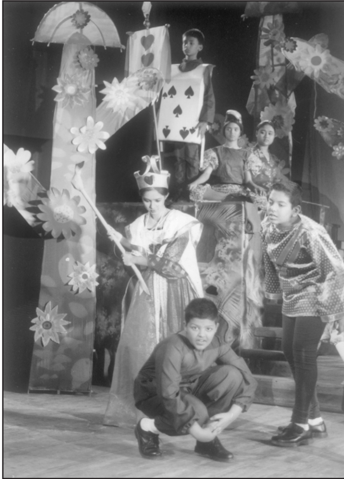
The Queen of Hearts playing croquet

Throughout her journey in Wonderland, Alice met many of its crazy inhabitants, for instance The Mad Hatter, according to whom, time had stopped exactly at Tea-Time, 6:00 pm in the evening. He along with the Hare and ever-sleepy Mouse were drinking tea in oversized cups and pouring out more from even larger tea pots. The little mouse, much to everyone's delight, squeaked out every word. The famous Cheshire Cat was also there to greet Alice with his big grin and clever talk. Right at the end, Alice got a chance to be in a trial, where the Queen of Hearts declared her famous line 'Off with their heads!' to just