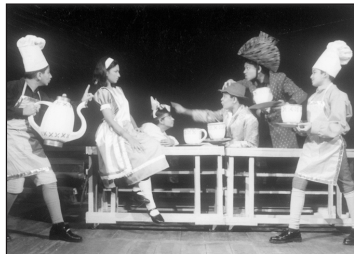
The Tea-Time scene

The spectators immensely enjoyed Alice's encounter with Humpty Dumpty, who was actually sitting on the wall, much to Alice's amazement. 'You'll fall off and break yourself. All the King's horses and men wouldn't be able to put you together you know!' cried Alice to the legendary egg.