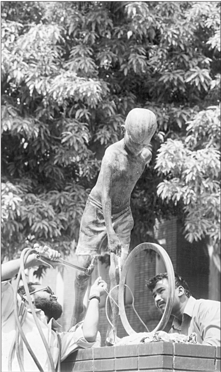
Finishing touches are being put to the repairs of 'Duronto' (above), on the left stands remnant part of the damaged statue and the ring.

"This is a work of art and once it is broken, you cannot expect the original effect even if you mend it," he said.