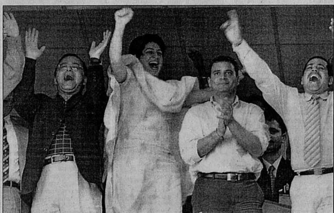
FAN TIME: Priyanka Gandhi (2nd from R), daughter of Indian opposition leader Sonia Gandhi, her brother Rahul Gandhi (2nd from R) and husband Robert Vadra (R) celebrate the exciting five-run victory of their national team against Pakistan at Karachi yesterday.