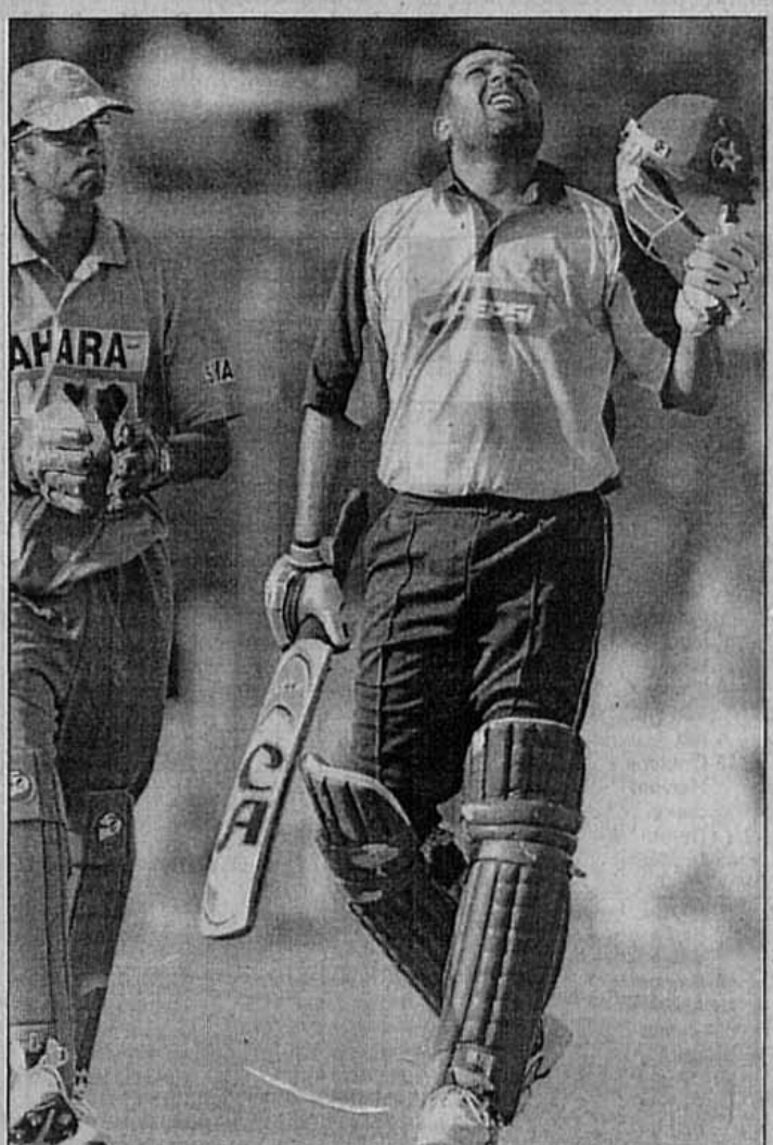
INZI SPECIAL: Pakistan captain Inzamam-ul-Haq looks towards the heavens after completing a sublime century in the first one-day international against India at the National Stadium in Karachi yesterday.