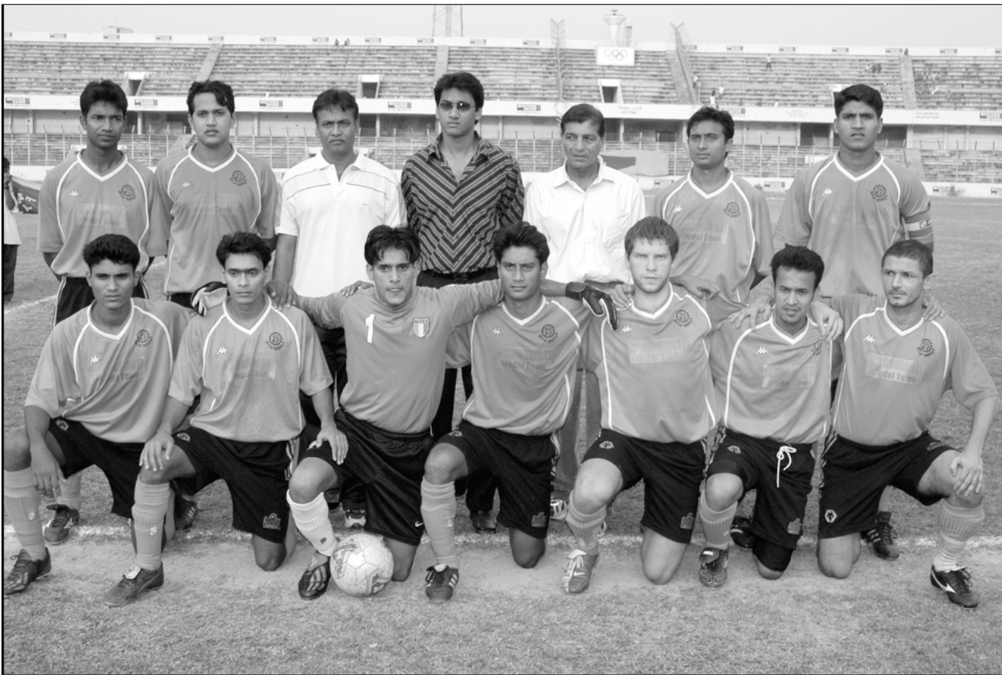
BAND OF BROTHERS: The newly crowned Premier League football champions Brothers Union pose at the Sher-e-Bangla Stadium yesterday.