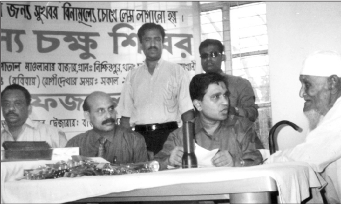
A four-day eye camp organised by Bashirullah Trust Charitable Hospital at Nishchintapur village in Chatkhil, Noakhali concluded on Wednesday.