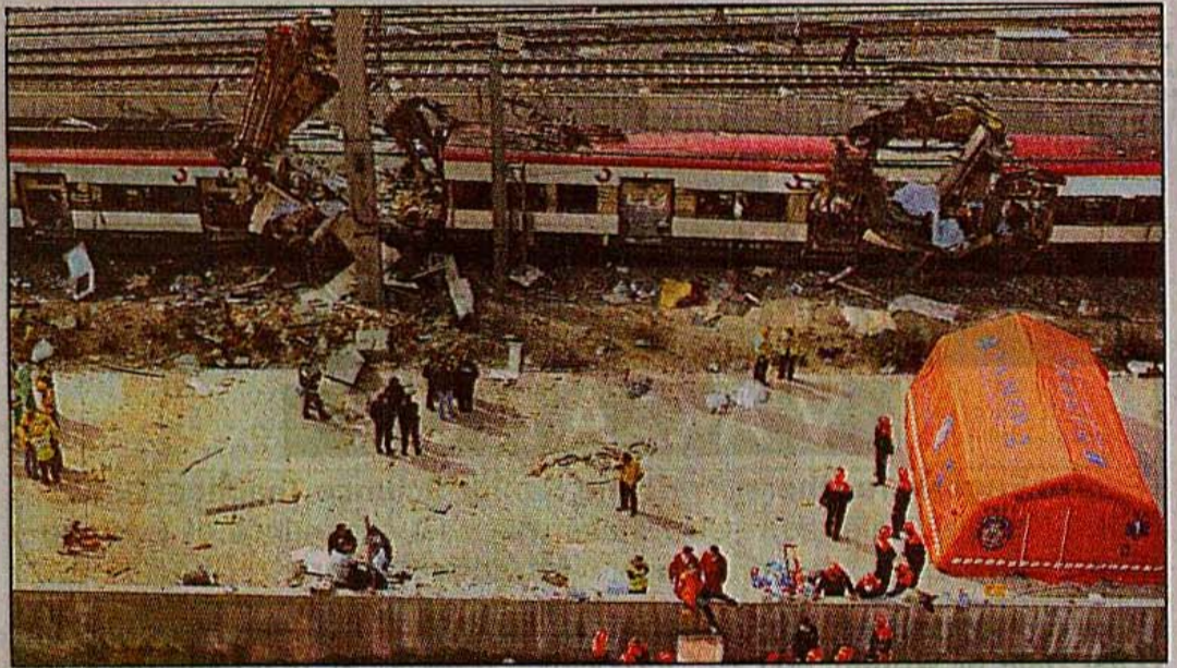
Bodies of victims are evacuated after a train exploded at the Atocha train station in Madrid yesterday. At least 190 people were killed and some 1,200 injured in near-simultaneous explosions on three trains in Madrid.

Spanish officials and media blame Basque separatist group ETA