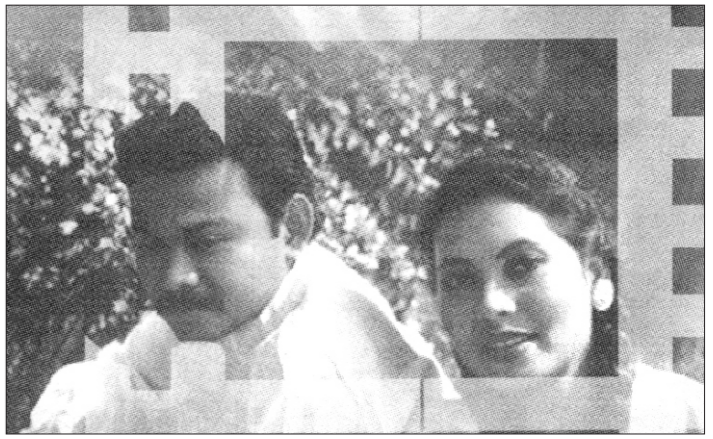
A still from the film Jantronar Jathorey Shurjodoy

Mukta, now pregnant, wants the child to be aborted, but the doctor contradicts as her pregnancy has reached quite an advanced stage. Mukta even tries