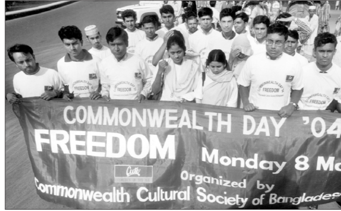
Commonwealth Cultural Society of Bangladesh brought out a rally, from the National Press Club to the National Museum on the occasion of Commonwealth Day 2004

Norway's films were recently screened at the International Film Festival in Dhaka. In the future too there is likely to be a closer cultural link between Bangladesh and Norway in the spheres of films and children's literature, she said.