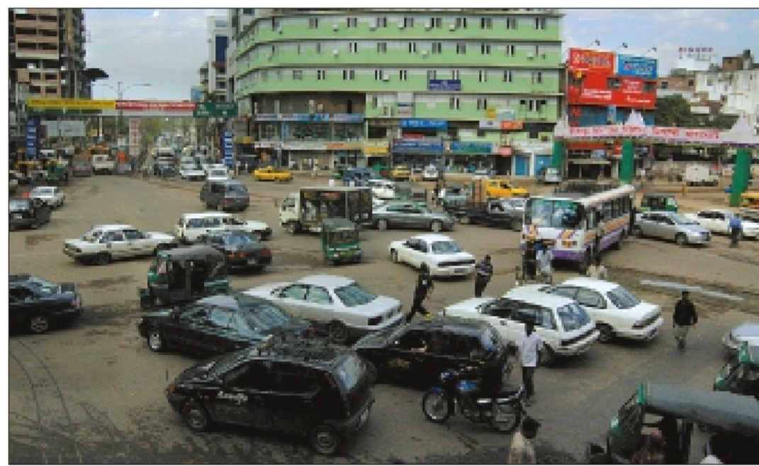
City authorities have removed the roundabout from Gulshan-1 to install modern traffic signals to streamline movement of vehicles. But the busy intersection turned chaotic as traffic moves at will.