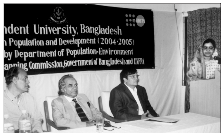
The Department of Population-Environment, Independent University, Bangladesh, organised a two-day workshop on 'Population Health and Development' that concluded yesterday. The government, the planning commission and the UNFPA sponsored the workshop held on the university campus in the city.