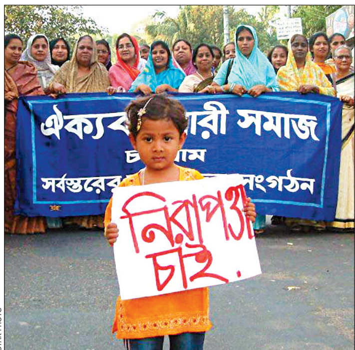
Oikyabaddhwa Nari Samaj brought out a procession in the city on Wednesday demanding safety of women and an end to violence against them.