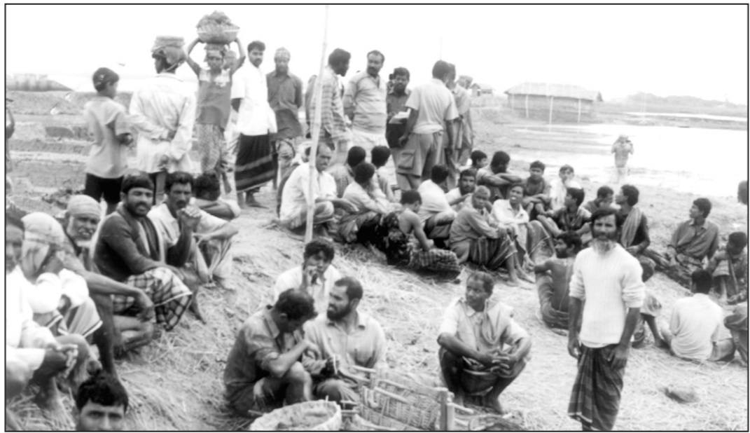
People taking a break while giving finishing touches to the reconstructed embankment at Balabaria in Satkhira. The dam brought new hope for them.

Besides benefiting the affected people, it will also earn foreign exchange, he said.