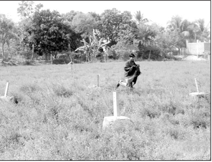
APDB tower (left) with the wire stolen at Premtali and remains of another stolen tower, right.