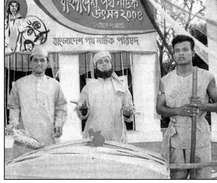
Protichchobi Theatre presenting Bou, a Street play at the Shaheed Minar

After his speech, eight groups staged patha natok . The participant-groups were-- Aranyak Natya Dal, Shubochon Natya Shangshod, Samay Shankskritik Goshthi, Desh Theatre from Srimongal, Natyadeep, Natyakunjo,