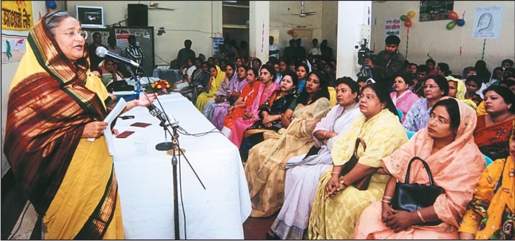
Leader of the Opposition in Parliament and Awami League President Sheikh Hasina speaks at a discussion on International Women's Day at the party office in the city yesterday.

Eminent legal experts, government officials, academicians, NGO and civil society leaders from five South Asian countries Bangladesh, India, Nepal, Pakistan and Sri Lanka - took part in the workshop.