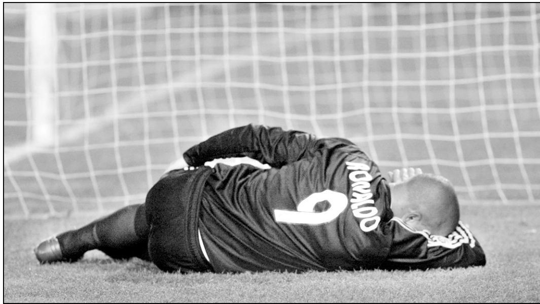
THERE GOES THE BAYERN CLASH: Real Madrid's Brazilian superstar Ronaldo lies on the ground after straining his right thigh against Racing de Santander at the Sardinero stadium, in Santander on March 6.