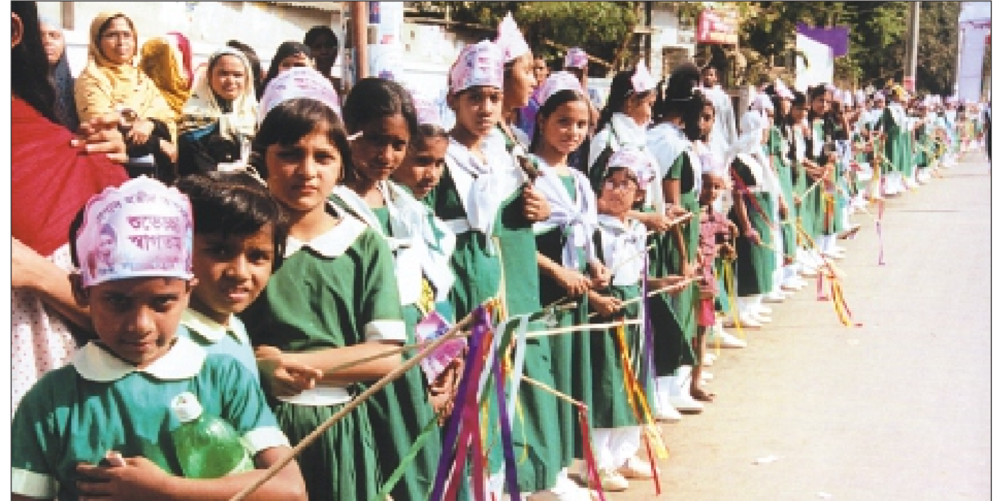
NO CLASSES! Schoolgirls line up a road leading to Lalbagh to welcome Prime Minister Khaleda Zia on her way to a public rally in Lalbagh yesterday. Allegations are there that local leaders of the key ruling party BNP forced the children under threats of dismissal from school to stand by the street risking hartal violence.

DU CORRESPONDENT Activists of the student wing of BNP on the Dhaka University (DU) campus yesterday forced the Humayun Azad Mancha (HAM) to abandon its cultural programmes to protest the gruesome attack on the eminent writer. A group of Jatiyatabadji Chhatra Dal (JCD) members snatched away microphones from the stage and threatened the HAM organisers not to hold any further protest programmes under the banner -- Humayun Azad Mancha to Protect Free Thinking and Resist Undemocratic Forces, witnesses said. "In the face of the JCD's threats we had to stop our programme today after rendering only two songs," one of the HAM members