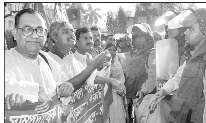
Police intercept a procession of the Communist Party of Bangladesh at the Zero point in the city during hartal hours yesterday.