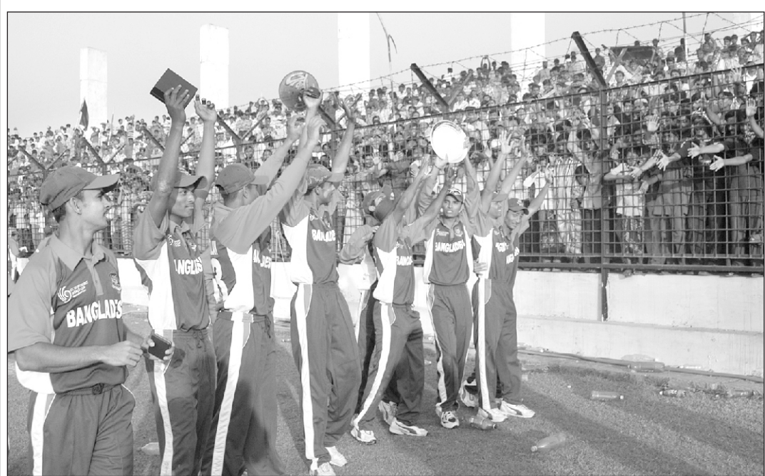
Bangladesh team members are on a victory lap after they defeated Australia in the Plate Championship final of the ICC U-19 Cricket World Cup at the Fatullah Stadium in Narayanganj yesterday.