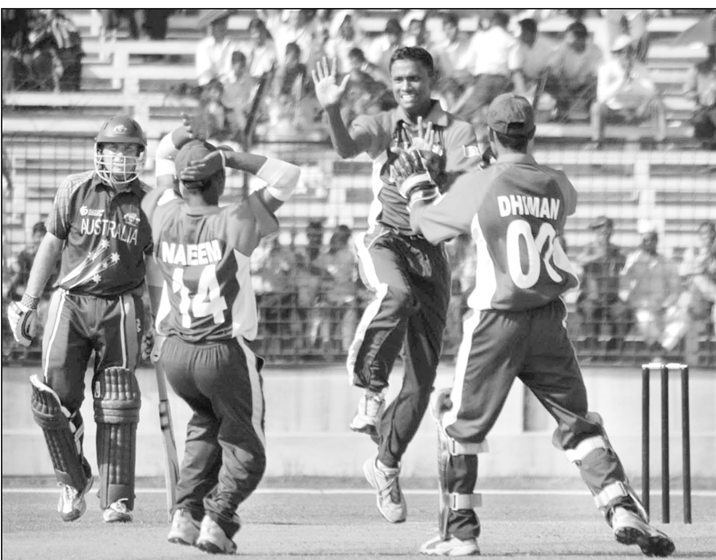
AND THE CELEBRATION BEGINS: Bangladesh players are joyous after the fall of the last Australian wicket during the Plate final yesterday.