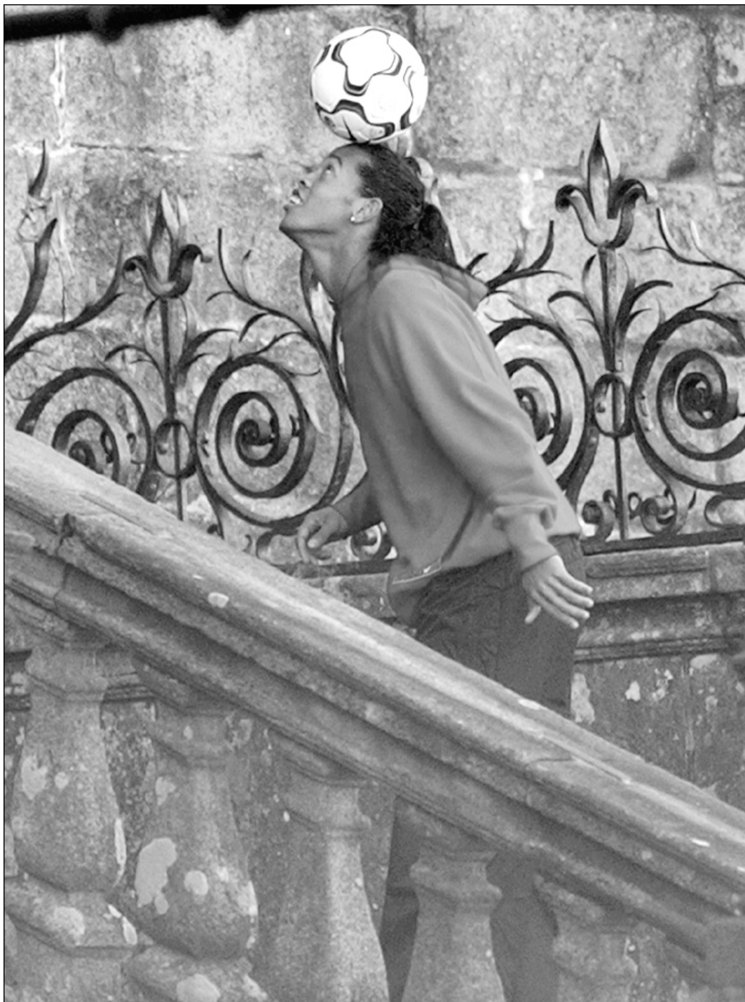
HOLY GROUND! Barcelona's Brazilian superstar Ronaldinho, plays with a ball during the recording of an advertising spot of the Holy Way of Santiago (Camino de Santiago) in front of the Cathedral of Santiago de Compostela on March 1.