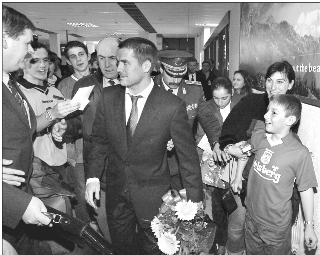
Bulgarian fans crowd near Liverpool's Michael Owen after his arrival at Sofia on March 1.

Former European champions Marseille meanwhile head to the cold of Ukraine to put a narrow 1-0 lead against Dniepropetrovsk on the line.