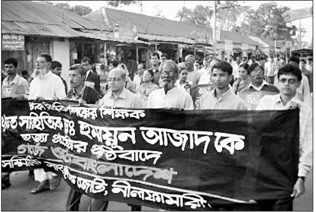
Nilphamari unit of Sammilito Sangskritik Jote, took out a silent procession in the district town on Tuesday in protest against the attack on Humayun Azad.