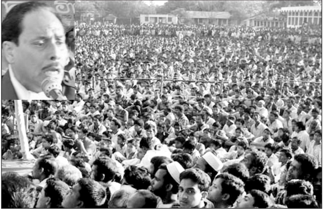
Jatiya Party chief HM Ershad (inset) addressing a public meeting at Mohimaganj High School ground.