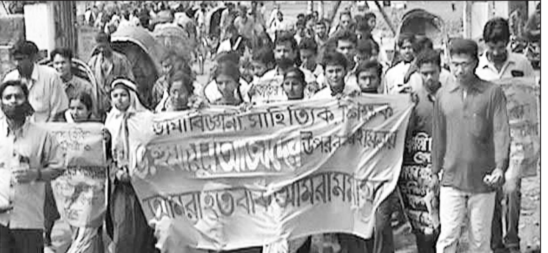
Teachers and students of Anandamohon College brought out a procession at Mymensingh town yesterday protesting the attack on noted literatteur Dr. Humayum Azaz.